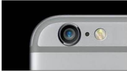
Single image capture