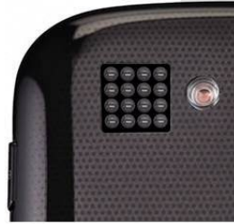
Array image capture

Figure 1. The future of smartphone cameras is to migrate from single point image capture to array image capture combined with sophisticated image processing software.